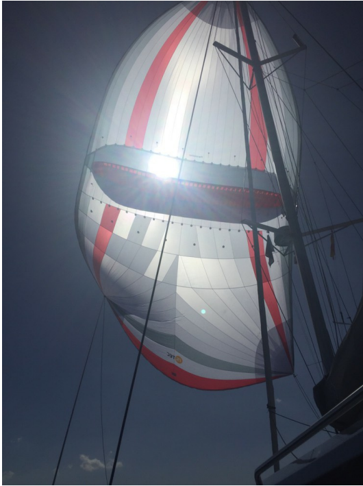
Cabrera here we come